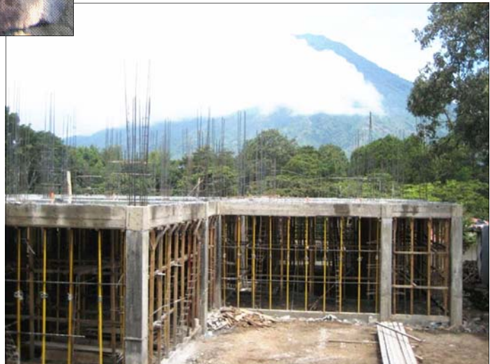
Finally, on June 5th, the second floor was poured and the building is taking shape just in time for the new rainy season.