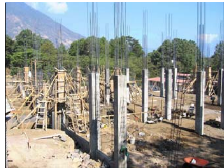
The columns stick out of the dry April ground.