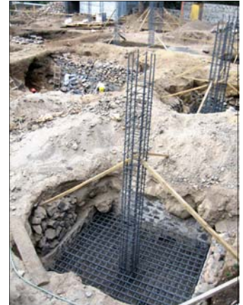
By March the work moved above ground for the footings.