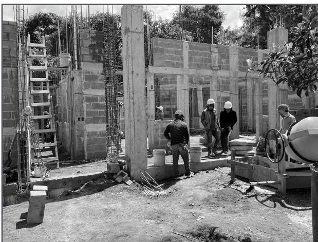
Construction began on August 1, 2022.

In August of this year, Hospitalito broke ground for the Expanding the Vision campaign, our first major construction project since the new hospital was built over a decade ago. The new annex will provide urgently needed space to complete laboratory services with a blood bank, add four new consultation rooms, and create classrooms for a new nursing school.