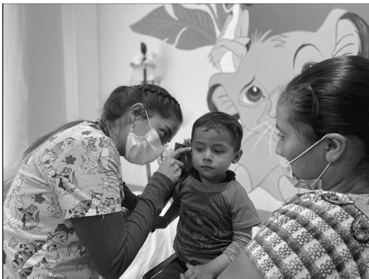
Three-year-old patient with pneumonia.

Hospitalito Atitlán works every day to improve the health of the Tz'utujil and Kaqchikel Maya - not only within the walls of our building, but also through community outreach to families in rural impoverished communities. Our medical teams travel to some of the most hard-to-reach areas in the region.