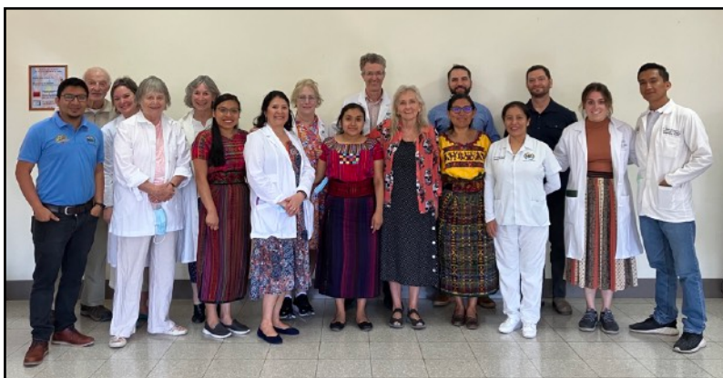
Pediatricians and staff at the beginning of the week