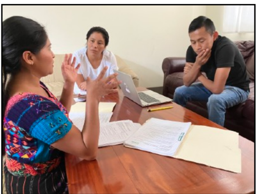
Nursing Director shares experiences.

Thanks to you, our donors, construction of the new nursing school, four clinics, lab and blood bank was completed in December.