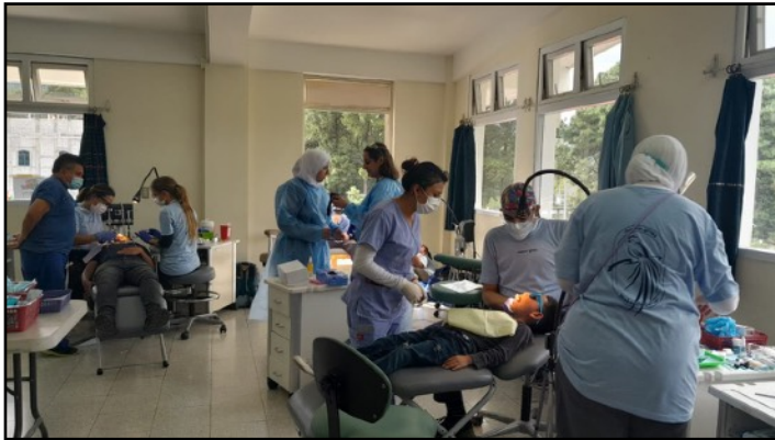
Pediatric dentistry is a speciality unavailable in Guatemala

Several surgical teams faithfully return to Santiago Atitlán each year to provide surgical care for patients who otherwise would be unable to resolve their health problems. Patients who can pay, provide a donation towards the cost. Those without financial resources receive surgeries for free.