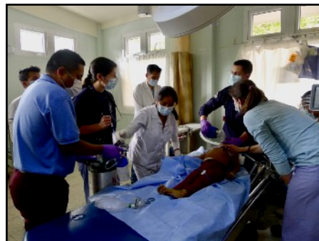
24/7 EMERGENCY CARE