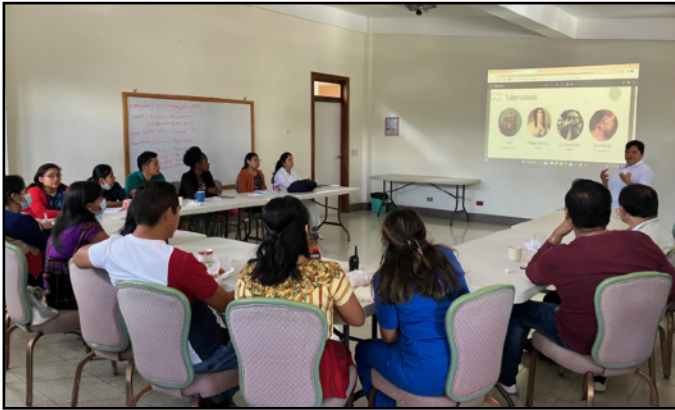
Staff receive Ministry training on TB