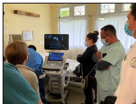
Mentoring staff in use of Ultrasound

Somos Hermanos is a non-profit organization in Xela, that hosts groups of Spanish students. The group leader brings the young people to tour HA. This year they had a radiologist who arrived to work with doctors and our x-ray technician.