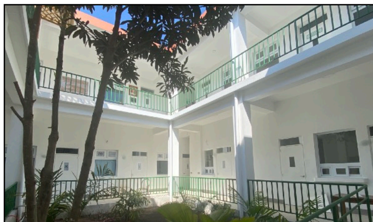
The new annex was completed in December 2023

The need for the blood bank is urgent. A Chemical Biologist will begin work at HA in 2024, and help with the adquisición of refrigeration equipment needed.