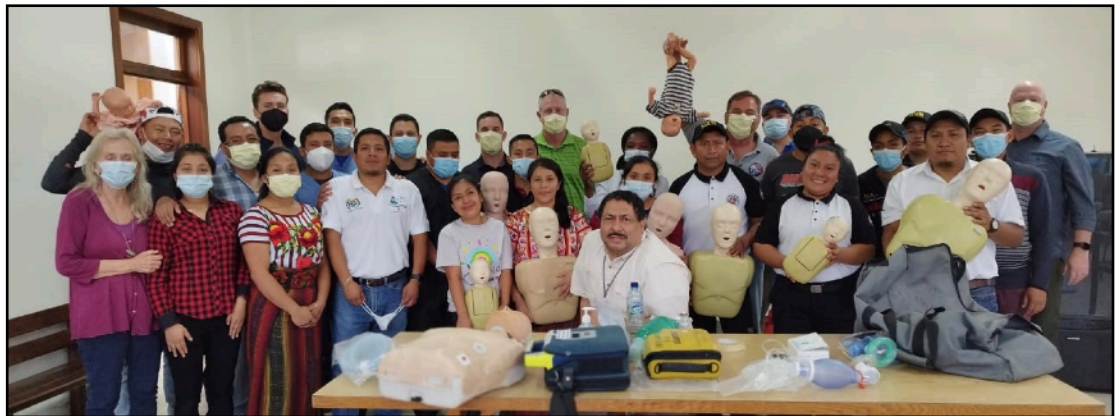
CPR trainings and simulations are part of ongoing continuing education for medical professionals

Firefighters and paramedics from Tacoma Washington coordinated a CPR training for HA staff and local rescue workers in January and a second training in March.