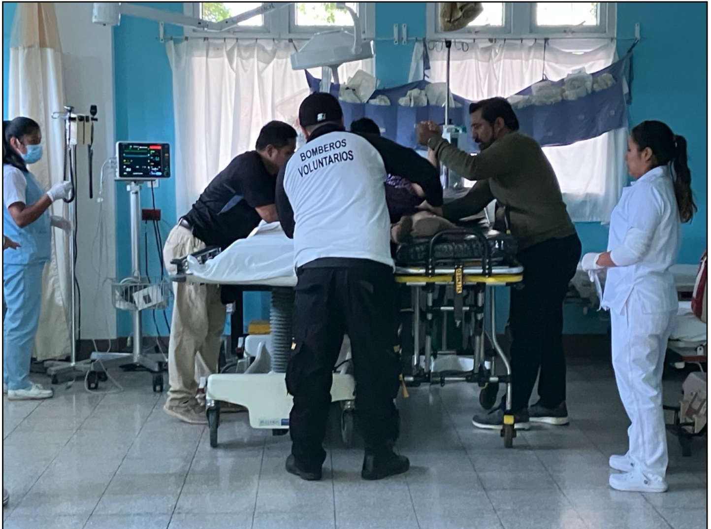
HA staff, rescue workers and family members help a patient in emergency

Hospitalito Atitlán has built a team of medical professionals — 64 doctors, nurses, pharmacists, lab and anesthesia technicians, administrators and support personnel. Thanks to their dedication and hard work, the hospital is able to provide around the clock quality medical care.